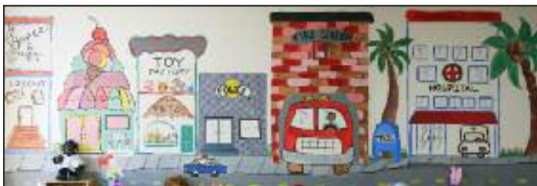
▲ Special thanks to Junior League of Miami Provisionals who undertook painting this mural for Kristi House's North office to make the waiting area more child friendly.