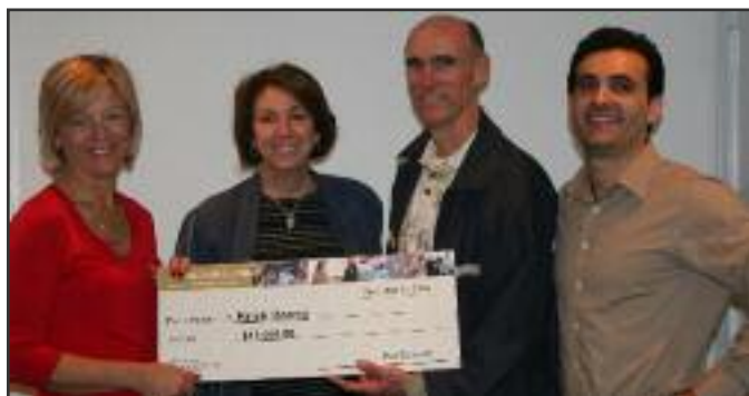
Representatives from Boston Scientific present Kristi House with a $15,000 check representing a grant for Kristi House Therapy Program.

specializing in magazine and online media with extensive experience in U.S. Hispanic and Latin American markets. He is currently Managing Editor at Latin Trade , the premier pan-regional business magazine published monthly in English and Spanish for 15 years. In the past he served as Principal at WPA Media Group and Editor & Publisher for South Florida CEO Magazine . He is a graduate of the University of Florida. ♥