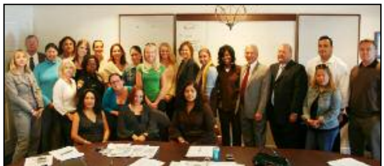
Miami CSEC Working Group members at their spring meeting.

state, and local law enforcement agencies and prosecutors; the Florida Department of Children and Families; Miami's community-based care provider, Our Kids of Miami-Dade/Monroe, and their seven subcontracting agencies that make up the privatized out-of-home care