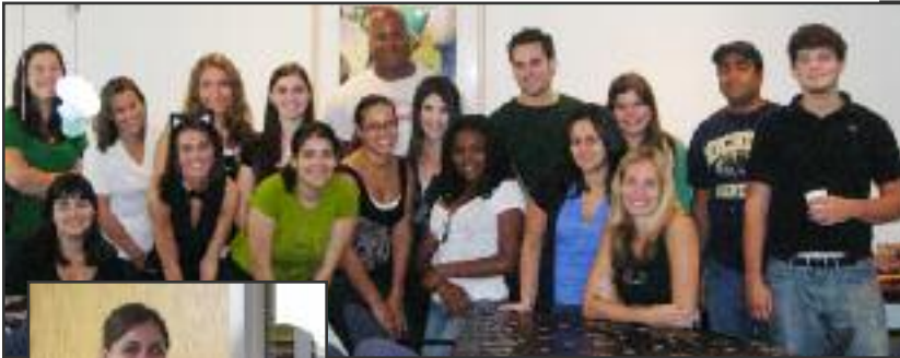
The University of Miami School of Law group, HOPE (Helping Others through Pro Bono Efforts) help make the holidays special for Kristi House kids.

Gifts of talent, time and treasure sustain Kristi House clients during difficult days